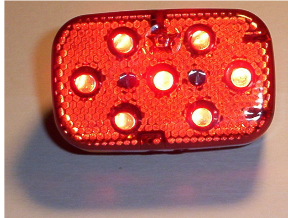
Red or Clear Case Dimensions for lights 1 through 6: 2.75" by 1.75" by 1.5".